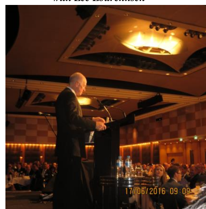
Guest speaker Glenn Stevens of the Reserve Bank