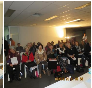
Christian Democratic Party Launch Day at the Head office