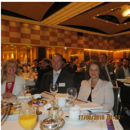
Sydney Prayer Breakfast at Westin Hotel