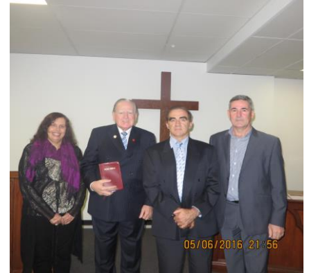
Rev Hon Fred Nile with the meeting in the Perth Church of Christ