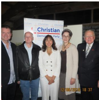
Rev Hon Fred Nile and wife with Tasmanian Candidates